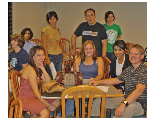
Interns and mentors get to know one another.